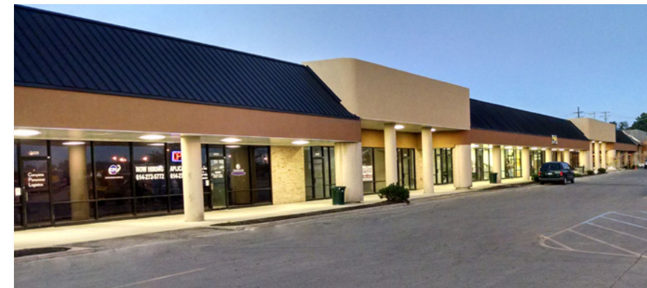
New Strip Renovation